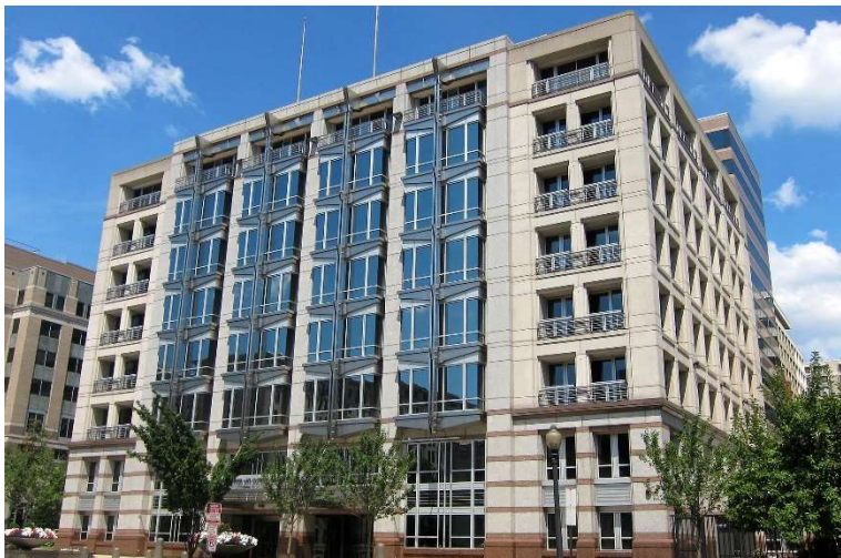
American Chemical Society headquarters in Washington, D.C.